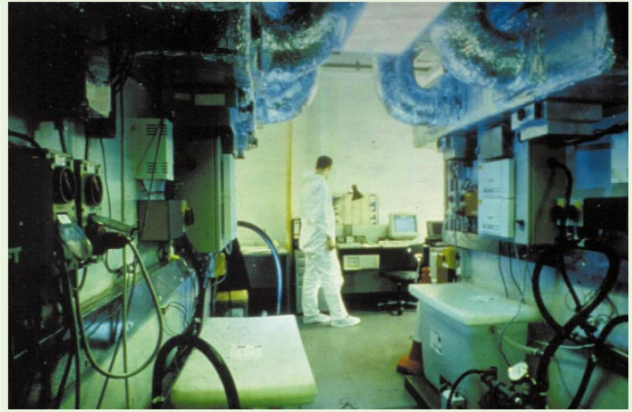
Figure 1 The Ecotron experiment creates model multitrophic community assemblages containing plants, herbivores, parasitoids and decomposers in 16 different chambers. The Ecotron is an ambitious attempt to bridge the scale between field communities and laboratory experiments. (Photographs show the inside of an Ecotron chamber and a technical service corridor between two banks of chambers; courtesy of the Centre for Population Biology, Imperial College at Silwood Park.)

fairly regular waxing and waning of a population's density). Such background population variability, whether driven by biotic or abiotic processes, can provide species with the opportunity to respond differentially to their environment. In turn, these differential species responses weaken the destructive potential of competitive exclusion.