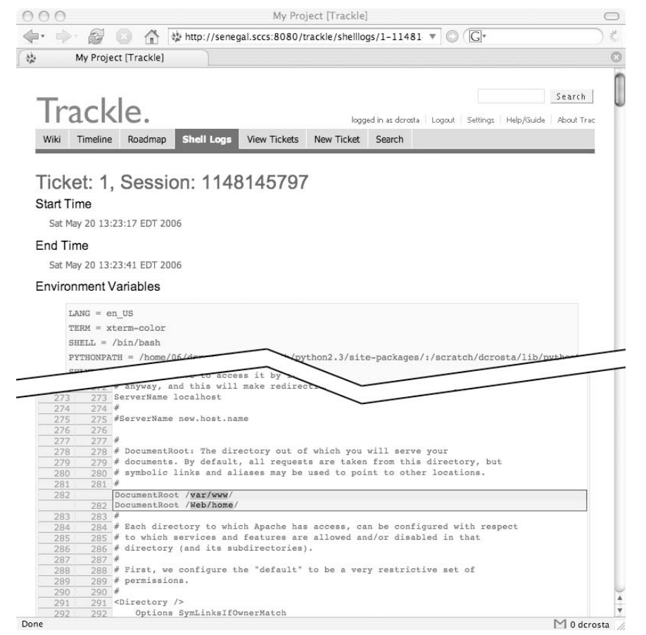
Figure 3 : The shell session log displays all the data that was recorded during the shell session. At the top, the shell history, start and end times, and environment variables are displayed. Below, the contents of files that were changed are shown with deletions highlighted in red and additions in green.

Shell session logs: All the information recorded in a shell tracking session is presented in the web interface in a shell session log (Figure 3). They are accessible to authenticated sysadmins through an index where they are sorted by ticket, with the most recently added shell log appearing first. The logs are also linked individually from the associated ticket. In keeping with the ideal of providing the most functionality while imposing the least structure, Trackle shell