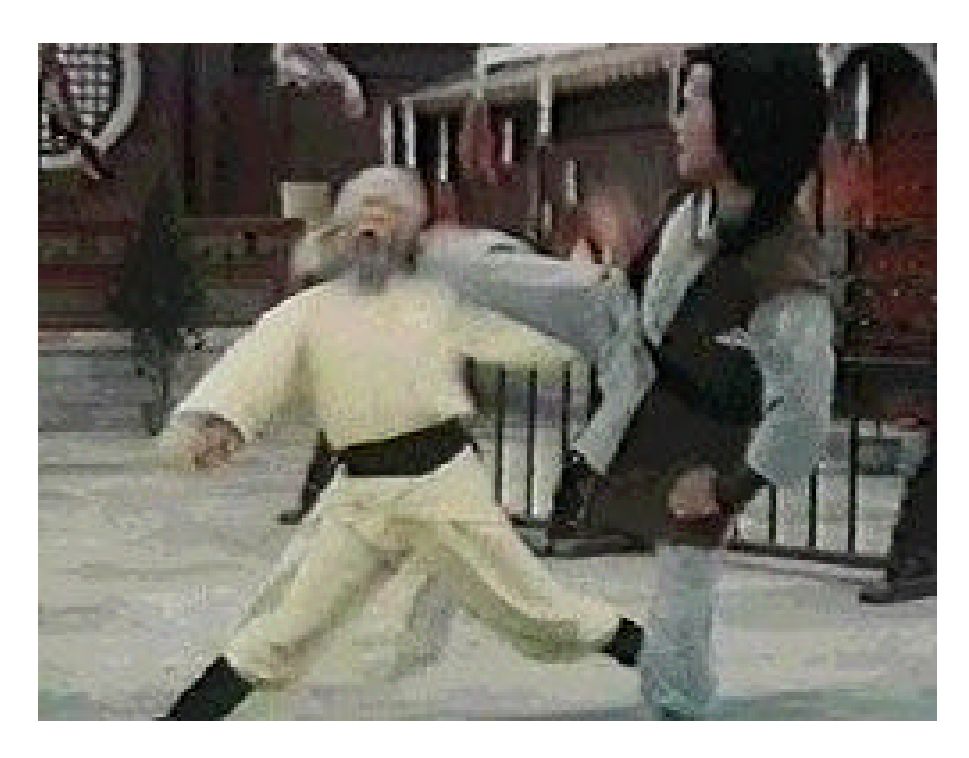
"I made a vow not to kill, but it seems I must!"